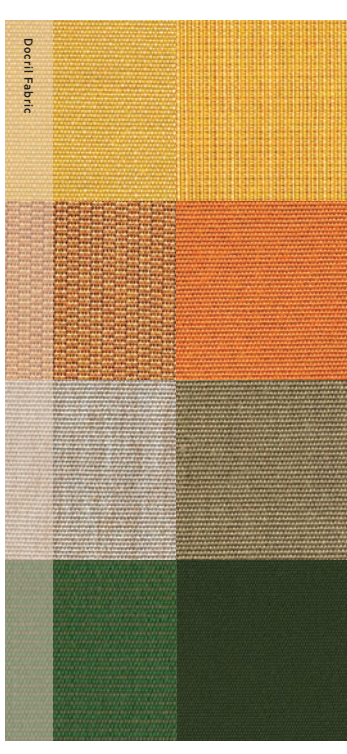
Docril offers an impressive selection of 132 vibrant colours to suit any décor and comes with a 10 year UV warranty.